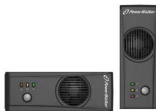
2-in-1 Rack/Tower design