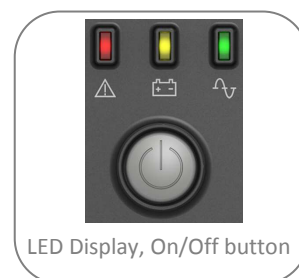
LED Display, On/Off button