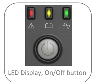
LED Display, On/Off button