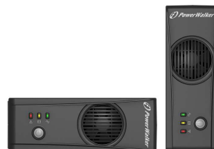
2-in1 Rack/Tower design