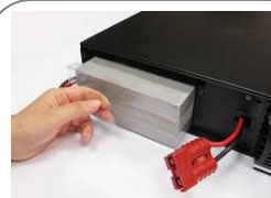
Hot-swappable battery design