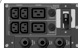
4x IEC C13, 2x IEC C19, Terminal ports, MBS