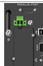
EPO port, USB, RS-232, Intelligent Slot